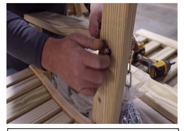
Complete fastening the armrest to the back support using a washer and lock nut. Tighten using 1/2" socket.