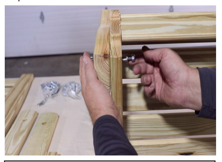
Fasten eye bolt with a washer and lock nut. Repeat steps 4 and 5 on opposite side.